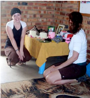
Buying craft items

"Initially the Ubuhle Project was just about the kids. We were so impressed with what they did for the kids and how it changed their lives. When the manager approached us as caregivers to get involved in a craft project. I was the first one to respond. There was only 2 of us that attended the meetings for a while, but I did not give up. Later more ladies joined me. Now I have something meaningful to do with my life, especially since I was in an accident and am now physically disabled."