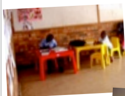
The primary and secondary school children

are assisted with homework in the afternoons.